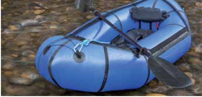
Dinghies