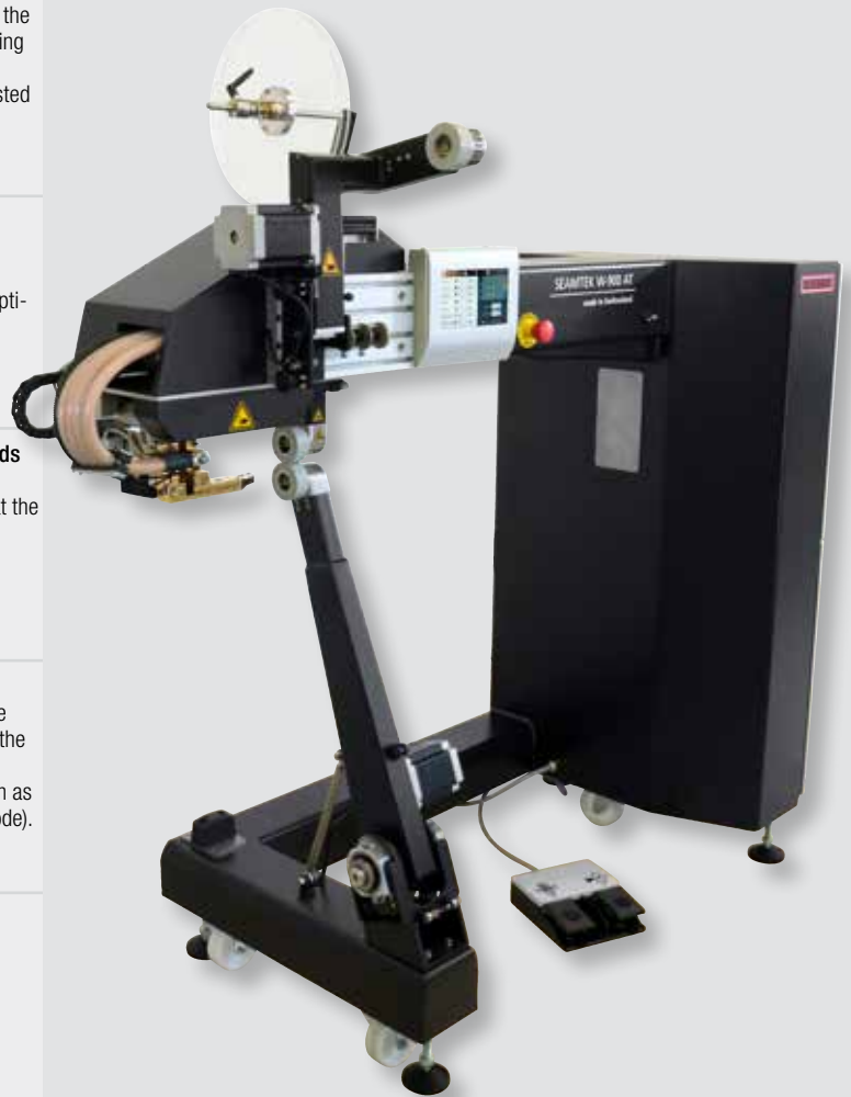
LEISTER SEAMTEK W-900 AT