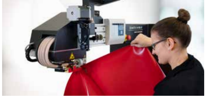
Innovative hot-wedge technology